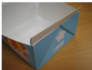
9. Do the same with the other edge.