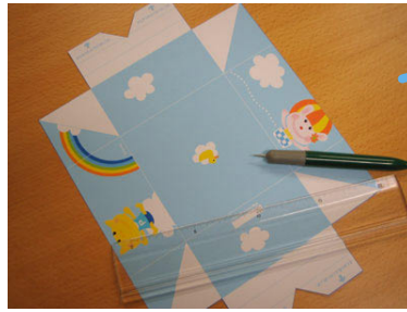
2. Use a stencil pen to trace the fold lines.