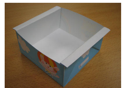
10. Follow step 7 to make the upper part. Now, we are finished.