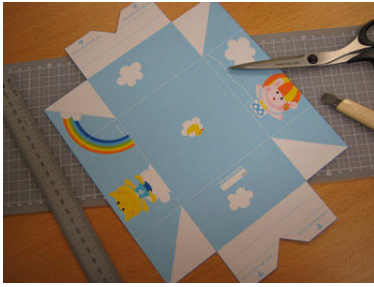
1. Cut on the outside lines.

Size: 10 x 10 x 5 cms. (A4 Sheet) 3.8 x 3.8 x 1.9 inch (Letter Sheet)