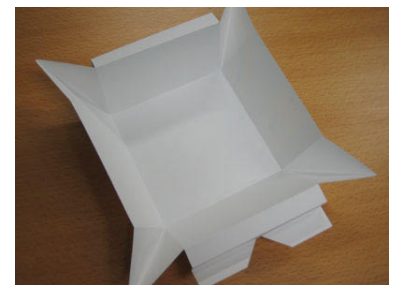
7. Do the same to the upper edge. Now we have every fold line we need to shape a box.