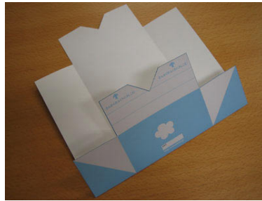
4. Fold the bottom parts.