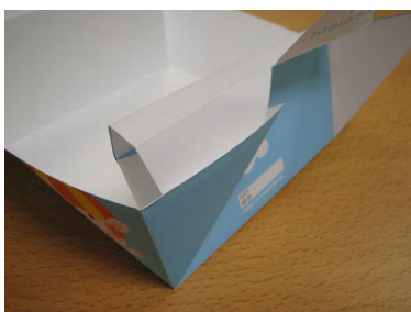
8. Put the edge of the handle part inside of the angled part done in step 6 .