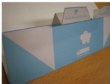
5. Fold the handles as shown in the picture.