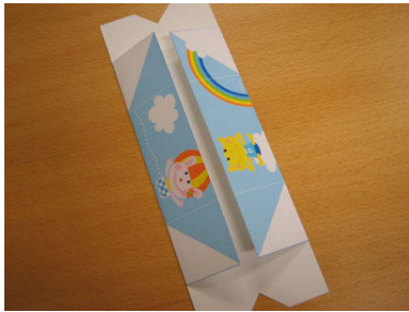
3. Fold the left and right edges to the center. After you have pressed the lines firmly, open it.